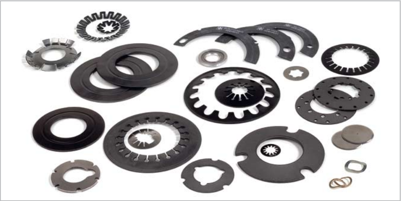
Springs with slots on inside and outside diameter