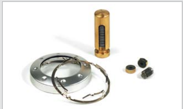
Pre-assembled spring units