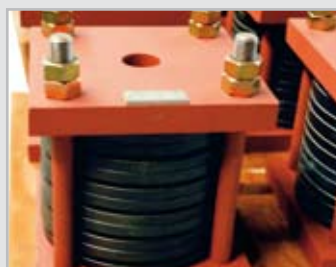
Converted spring columns, 100 % load checked