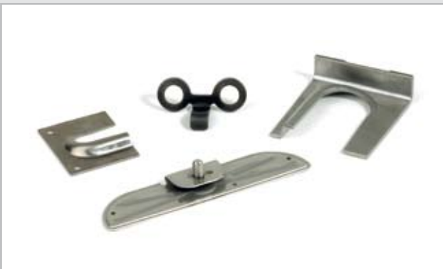
Formed metal plates with a spring function