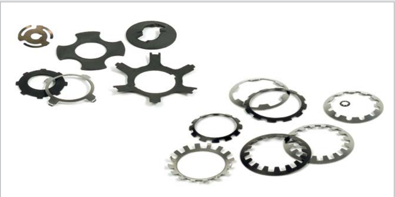
Applications, for example, in slip clutches for torque transformers in hammer drills