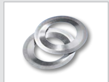
Springs for pressure limitation