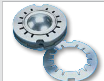
Springs slotted on the inside diameter