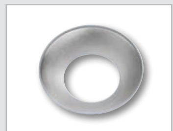
Gearbox dished washer